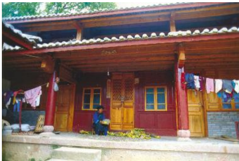
The featured Housing —“The Muleng house made of logs”

The Pumi people do not have their own characters. Some Pumi wizards used to record oracle inscriptions by simple picture writings. They also employed Tibetan letters to record Pumi-spoken scriptures of primitive religions, which is called “Han Gui Character”. Now the Pumis all use Chinese characters.